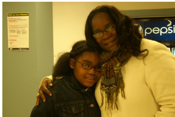
Annual Holiday Party