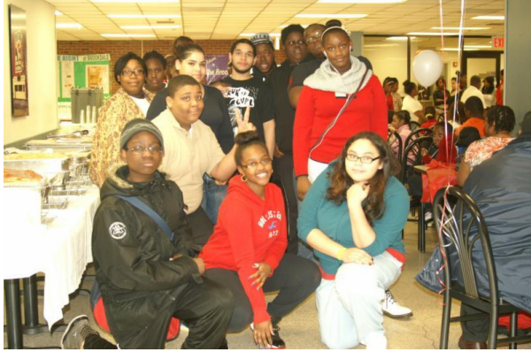
Annual Holiday Party

On January 17th, we held our annual holiday party at Brookdale Hospital Center . Nearly 200 hundred children and their families attended to celebrate the achievements and successes of those who have joined Live Light Live Right on this journey to promote health and fitness that have transformed their lives.