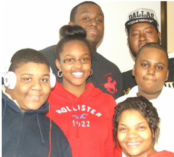
Annual Holiday Party